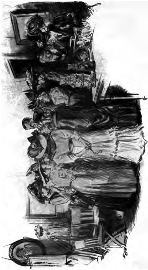
"How ex-quis ite!"—"Bee-yewtiful!" chorused the culture club